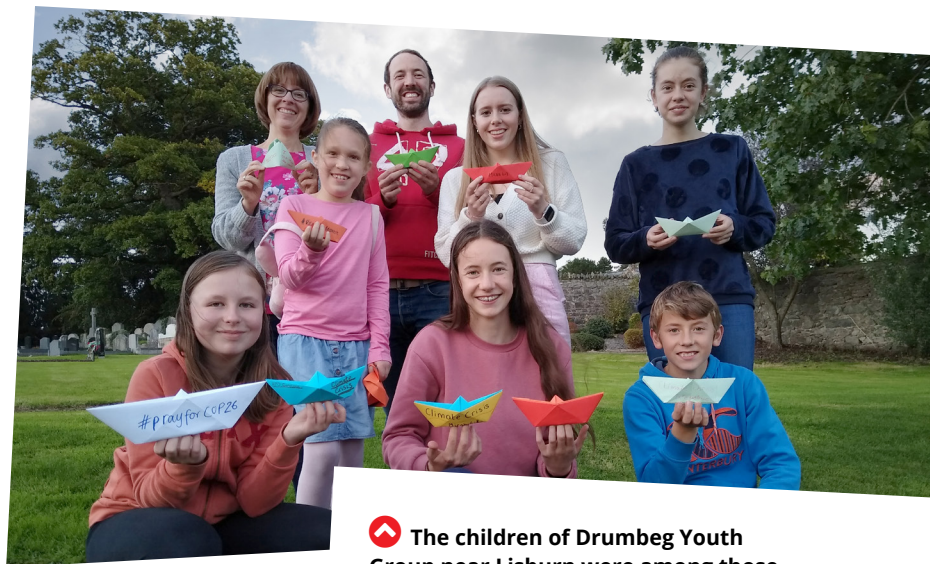
➤ The children of Drumbeg Youth Group near Lisburn were among those who made origami paper boats on which they wrote their hopes and prayers for the COP26 climate summit.

'In March, the Northern Ireland Assembly passed a Climate Act, something that Christian Aid has been calling for since 2008.'