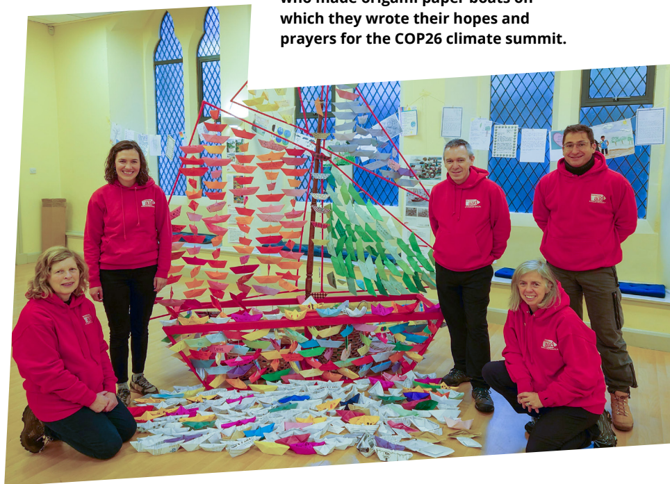
➤ Five Christian Aid Ireland staff and activists stand next to the 'flotilla' of origami boats displayed in a Glasgow cathedral during the summit.